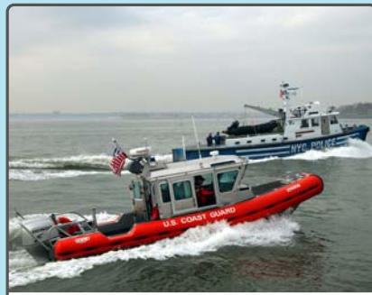
Ports, Waterways & Coastal Security