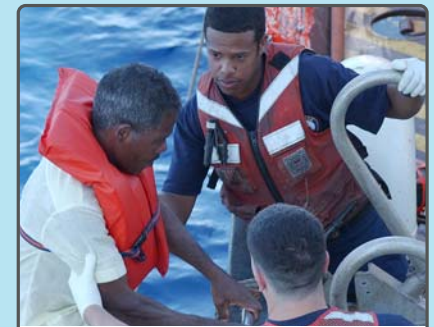
Undocumented Migrant Interdiction