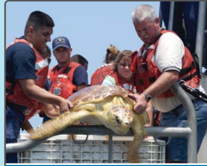
Living Marine Resources

The U.S. Coast Guard is the principal federal agency charged with maritime Safety, Security and Stewardship. The Coast Guard's multi-mission character is defined by its ability to conduct distinct yet complementary functions in the maritime domain - law enforcement, national defense, maritime mobility, maritime safety, environmental protection, and humanitarian response.