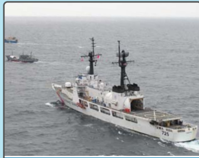
Other Law Enforcement