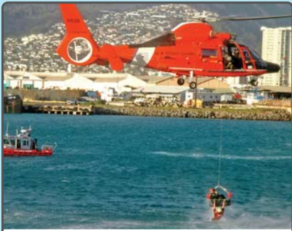
Search and Rescue