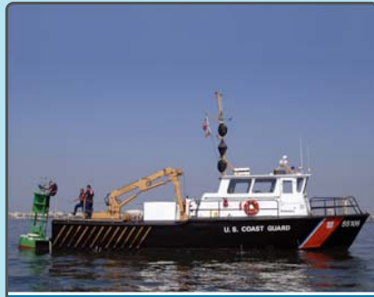
Aids to Navigation