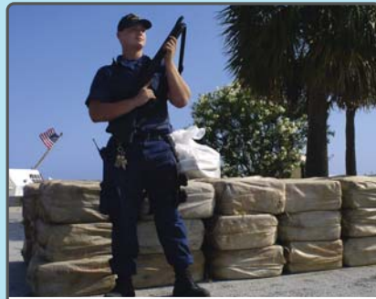
Illegal Drug Interdiction

The U.S. Coast Guard is the principal federal agency charged with maritime Safety, Security and Stewardship. The Coast Guard's multi-mission character is defined by its ability to conduct distinct yet complementary functions in the maritime domain - law enforcement, national defense, maritime mobility, maritime safety, environmental protection, and humanitarian response.